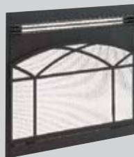
Interlocking Arch face panel