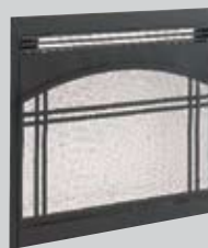
Mission Style face panel